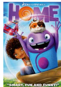
Home 2015 Rated PG 94 mins rated 5.0 stars